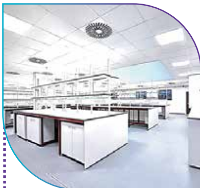
Complete design of Laboratory along with furniture installations