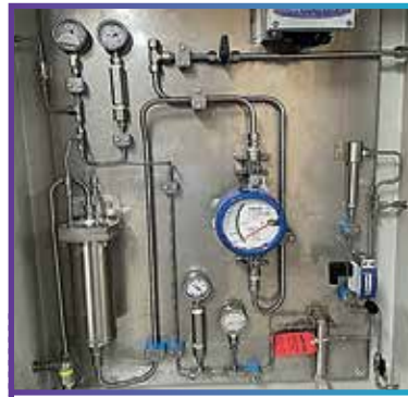
Water Quality (O 2 , DO, pH, TOC, Chlorine, Conductivity etc.) and all major Analyzer & Sampling system Integration and Site Installation