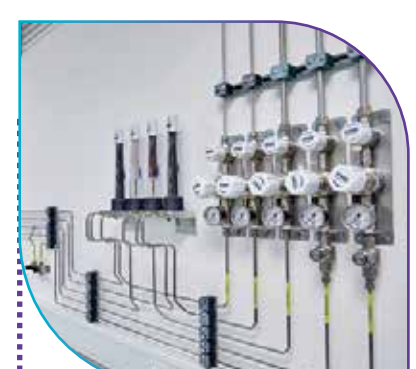
Complete Gas Distribution Systems (GDS) - Design & Installation