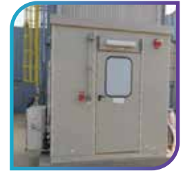
Hybrid Cool Shelter for Solar Application