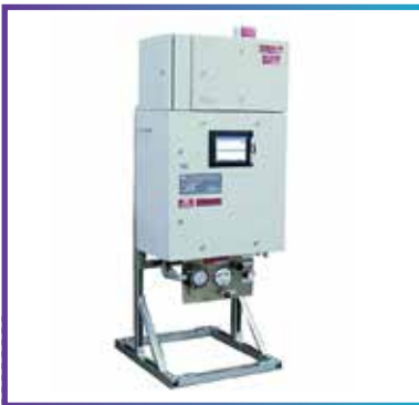
Total Nitrogen & Sulfur Online Analyzers

Online physical property Analyzers Online Oil in Water Analyzers Online Water in Oil (Water Cut) Analyzers WOBBE index Online Analyzer Density Analyzer Online Viscosity Analyzer Online TOC Analyzer