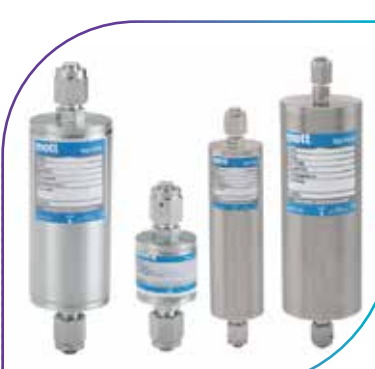
Gas Purification Filters