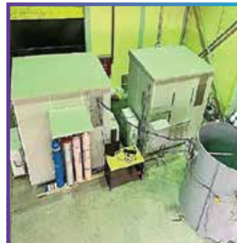
FAT with fully functional shelter, SHS, Model Stack fitted with gas, dust, flow, P&T and heated sample line