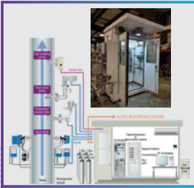
CEMS Analyzer system integration and Site Installation