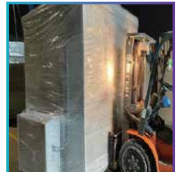
Packing & Loading for delivery