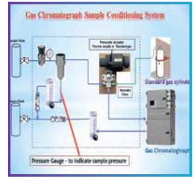
Revamping sampling system of Analyzers